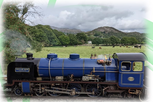
The La'al Ratty narrow gauge railway visitor attraction at Ravenglass and Eskdale

It has an extensive, attractive coastline stretching from the Solway Firth in the north to Morecambe Bay in the south. Locally, the beaches at Silecroft and Eskmeals are beautiful expanses of sand with crystal clear pools. Recently the coastal path has opened fully between Millom and Whitehaven, allowing access for walkers.