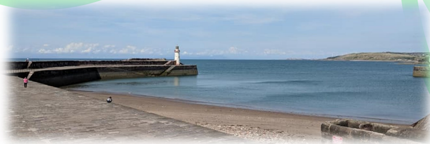
The harbour in the Georgian town of Whitehaven