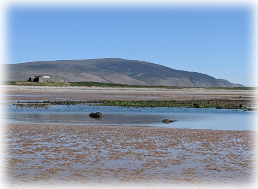
Black Combe from Eskmeals beach near Bootle

Cumbria is a delightful place in which to live and work and is a county of considerable contrasts. At its heart is the Lake District National Park, a UNESCO World Heritage Site. It also contains part of the Yorkshire Dales National Park and Areas of Outstanding Natural Beauty in the North Pennines, the Solway Coast and Arnside and Silverdale.