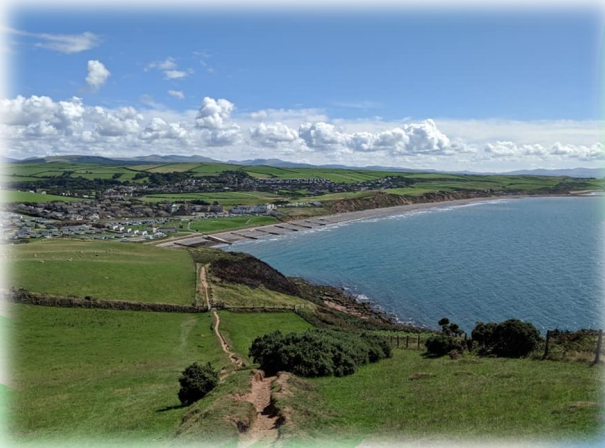
The village of St Bees near Whitehaven and the start of the Coast-2-Coast footpath