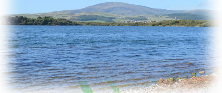
Black Combe from Hodbarrow RSPB reserve