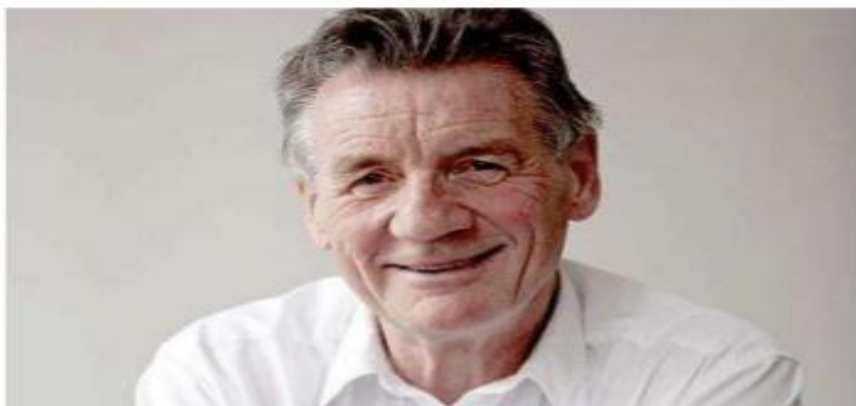
Michael Palin, Former president of the Royal Geographical Society