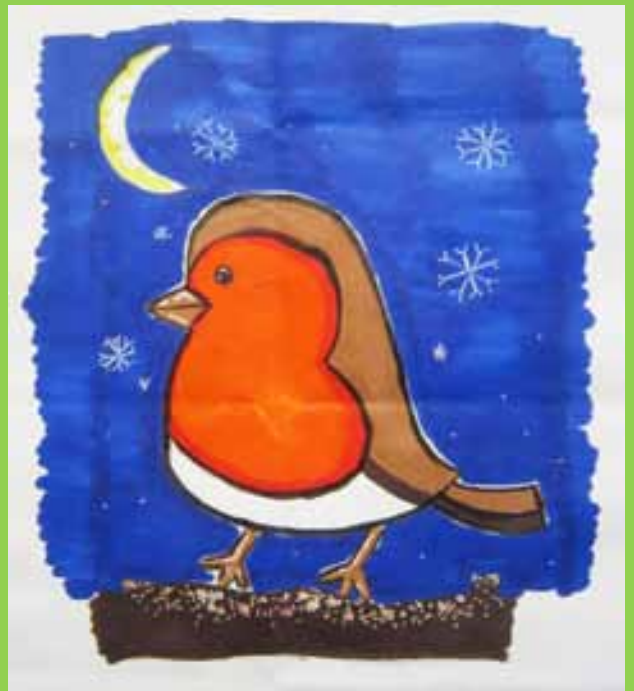
'Robin' By Imogen