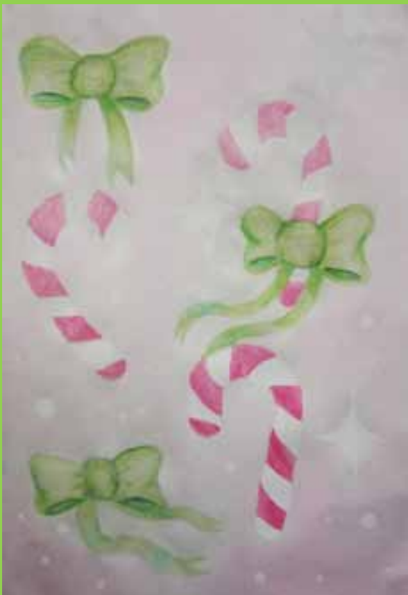
‘Candy Cane’ by Katie

Please label any items of uniform, coats, pencil/glasses cases etc. We have a number items handed to Reception daily with no way of identifying the item to a student.